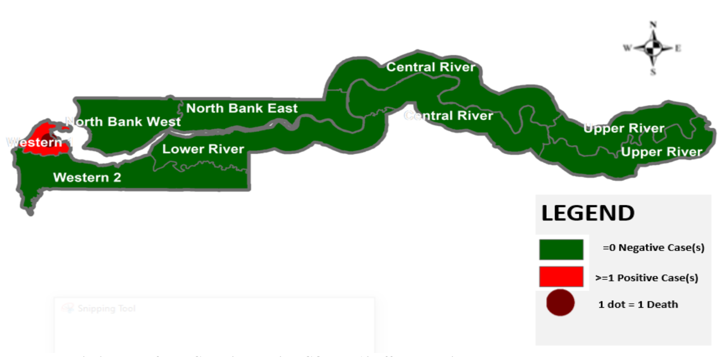
Fig 2: Map of The Gambia showing COVID-19 affected region